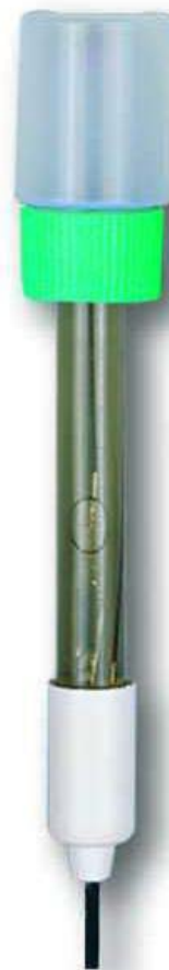
pH electroode ( optional )